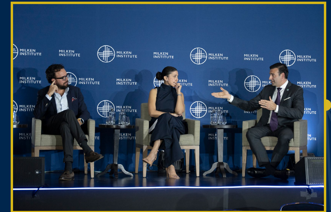
Fulfilling FinTech's Promise