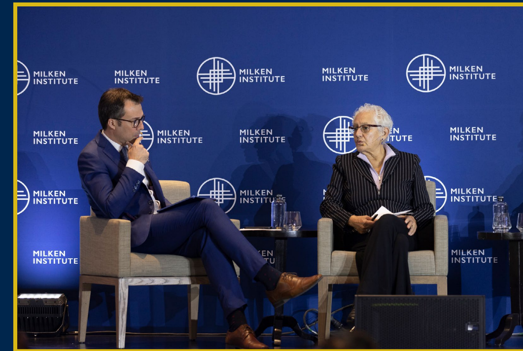
Banking on an Inclusive Future

Participants had the chance to delve into discussions on pressing topics like fostering inclusive growth, investing in sustainable food systems, driving innovation, advancing nearshoring, and exploring corporate impact across Latin America and beyond. Notable sessions included “Banking on an Inclusive Future,” “Evolution of Supply Chains in the Era of Nearshoring,” “Green Investments for a Sustainable Economy,” and “The Private Equity Edge.”