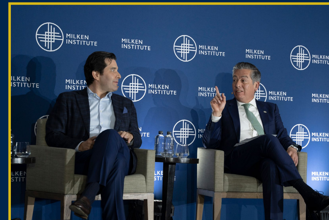
Evolution of Supply Chains in the Era of Nearshoring