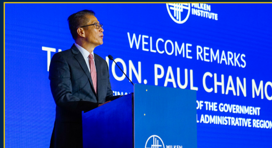
Welcome Remarks by Paul Chan, Financial Secretary, The Government of the Hong Kong Special Administrative Region