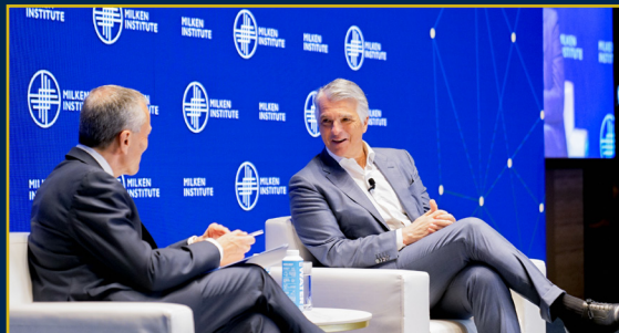
A Conversation with Sergio Ermotti, Group CEO of UBS Group AG