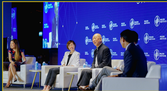
Fine-Tuning the China Growth Engine: An Investment Perspective