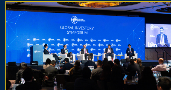
Renewed Opportunities in Private Markets