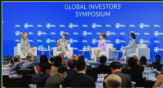
The Revival of Consumer Markets